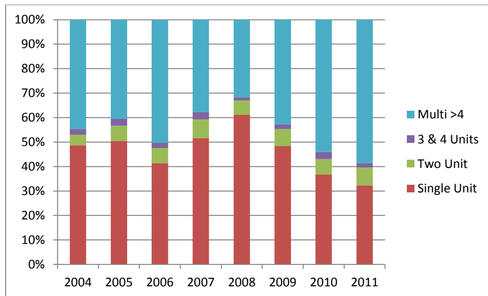
Fig. 1-1: New Dwelling Units in HRM by type (2004-2011) Source: HRM

One of the key trends in recent decades is the move towards higher density development largely explained by smaller household sizes and more difficult financing options. One-person households are currently the fastest growing category, increasing by 26% in the last decade 6 .