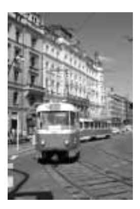
Interurbans were streetcars that started on city streets but then ran out to the countryside on their own tracks.

Few people today know about "interurbans", though before World War II they were an important mode of travel in North America. Interurbans were streetcars that started on city streets but then ran out to the countryside on their own tracks. They often travelled at faster speeds than automobiles attain on freeways or expressways today. Interurbans provided fast service from Toronto to Guelph and Lake Simcoe, and from Montreal to Granby, in the Eastern Townships, as well to Deux-Montagnes, a service still operating. In Vancouver, interurbans followed the same route as the SkyTrain to New Westminster. They also went to