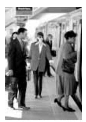
A two-track subway has the capacity of a twelve-lane highway and does not require parking space.

Of course, the traditional style of urbanism never stopped being available in many older and more central quarters of Canadian cities. However, since the price of a house is more expensive in these neighbourhoods, young families seeking cheaper housing tend to look for houses further away from the centre. They are also attracted to the heavily promoted suburban lifestyle, which offers newer houses and a promise (though not necessarily a reality) of greater quiet, cleanliness and safety. This preference for suburb over traditional neighbourhood reflects something more complicated than genuine "consumer preference" because