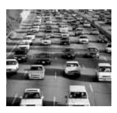
People who live in sprawling cities and suburbs today often express uneasiness about the immediate environment and frustration with getting from place to place.

Steveston, Langley and Chilliwack. In that era, families were able to choose suburban living without the sprawl since rails rather than highways were the dominant mode of transportation.