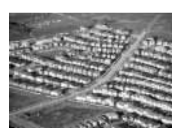
Not only does sprawl contribute to climate change, it consumes large quantities of land.

Not only does sprawl contribute to climate change, it consumes large quantities of land, segregates houses from shops and workplaces, depends on private cars, and has little regard for the natural environment. For many Canadians born in the last half of the 20th century and raised in suburbs, sprawl may appear normal and inevitable. But in reality, it is a result of deliberate decisions about how land is used and about the kind of transportation systems the government supports. By examining the history of current urban development patterns and their hidden costs, citizens will have the tools to compel wiser use of land and more efficient transportation policies.